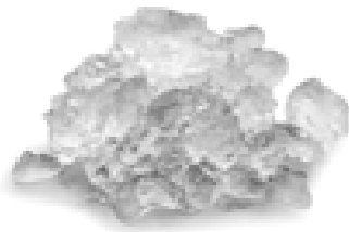
MXF 327 Superflake ice Residual water content 12%